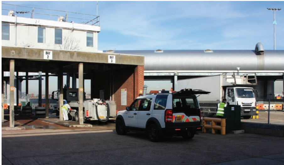
Above. One of Heathrow’s aircraft wastewater vehicles transports sludge to the Central Area Sanitation unit.

“Concertor’s compact design allowed it to fit into the existing position within the pump station, without any extra investment required to enlarge the cabinet. From an aesthetic and practical consideration the reduced panel-requirement size will be of great benefit,” Jolly said. “It was simple to install and very user friendly. Actually, the trial pump was installed by one of the airport’s water services mechanical technicians, who was not experienced in